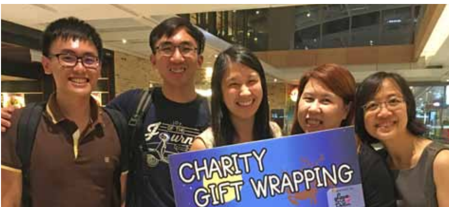
LoveFAD volunteers and HNF staff.

To date, more than $6,200 was raised in support of HNF. We would like to thank LoveFAD and all participating volunteers for their immense efforts and time in making this project a success.